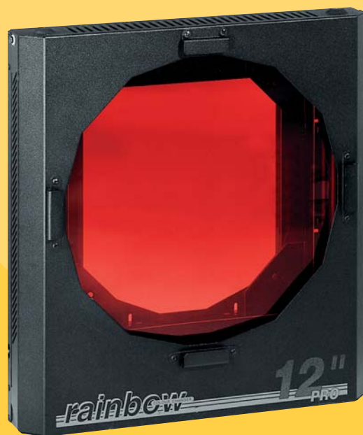
Partlist 12" PRO/PRO2 Colour Changers (known as RCC 3801)