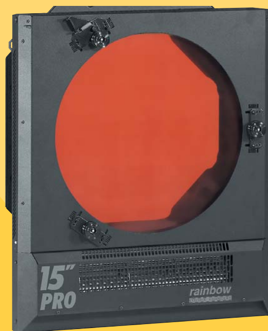
Partlist 15" PRO Colour Changers (known as RCC 5000)